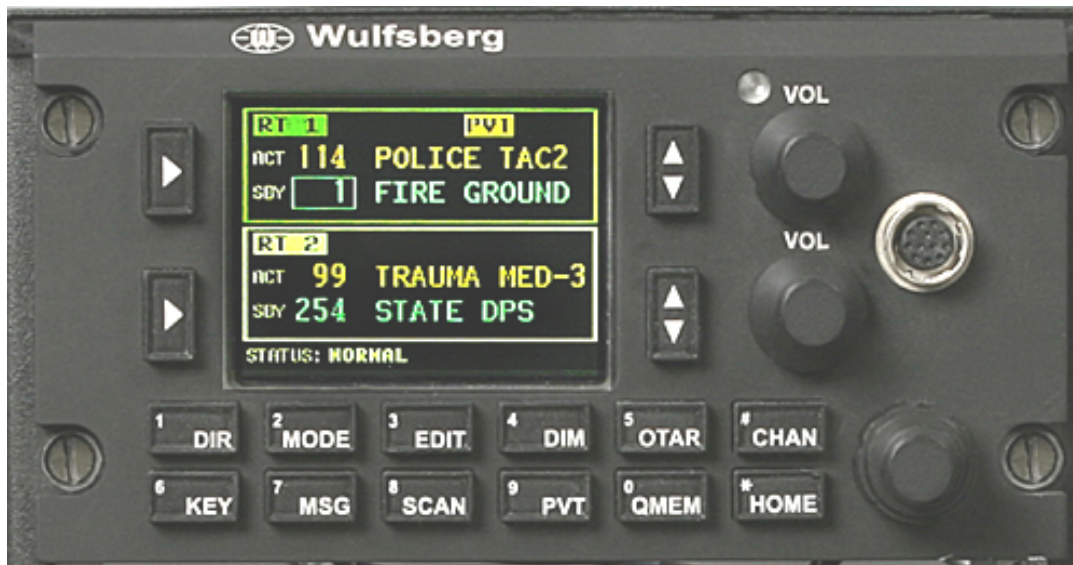
C-2000 Color Display Controls P-2000 Dual/Master/Slave or RT-2000 Control